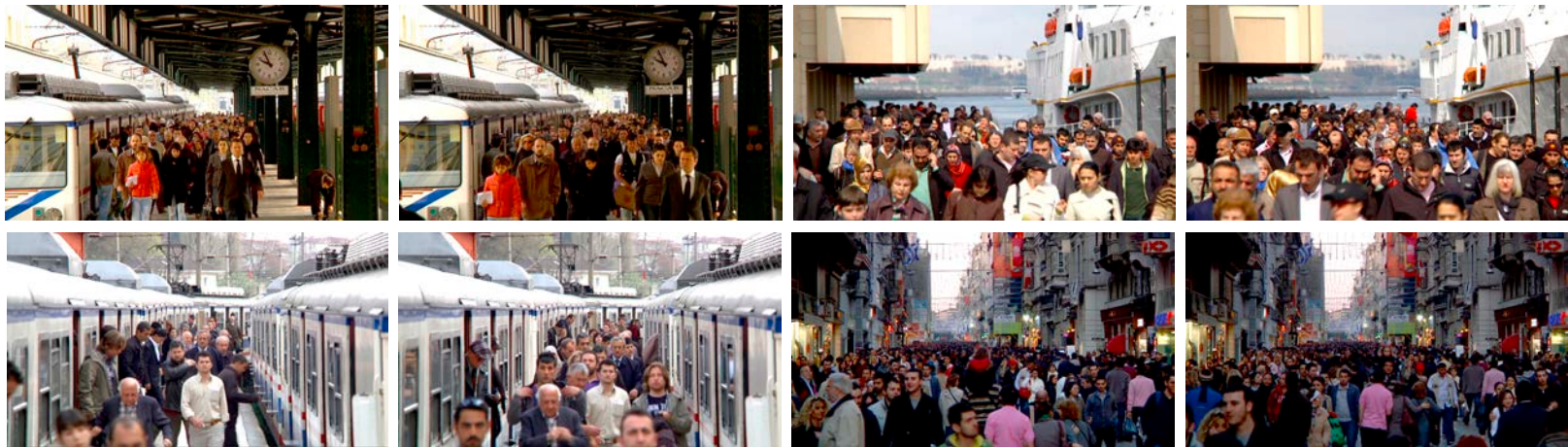
Video stills from the footage of VS Humanity – Istanbul, 2010

The second film captures from ground level a sea of people coming toward the camera in sequences filmed in different city locations (e.g. bus station, ferry boat terminal, busy streets).