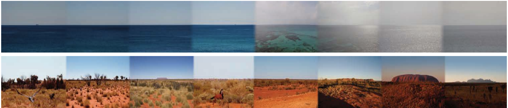
Bellow: V.S Nature, Installation details, Renderings

V.S. Nature sets humanity's parameters; it projects images of land and sea depicting our natural limits as a species inhabiting a fragile planet; The filming for Vital Space - Nature will take place in Australia , the oldest and less populated Continent on the planet. A place synonymous with the notion of migration. In this film the presence of humanity is suggested by its absence.