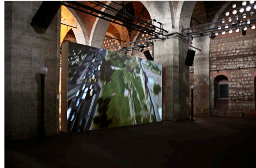
Video installation, V.S. Humanity. Tophane, Istanbul, 2010

The former offers the viewer a constant outward movement, as the camera attached to the front of the helicopter relates a constant flow of images taking the viewer seamlessly across the city from the centre outwards. In contrast the ground level film offers a different dynamic since the camera is static and the constant flow of humanity is coming toward the viewer.