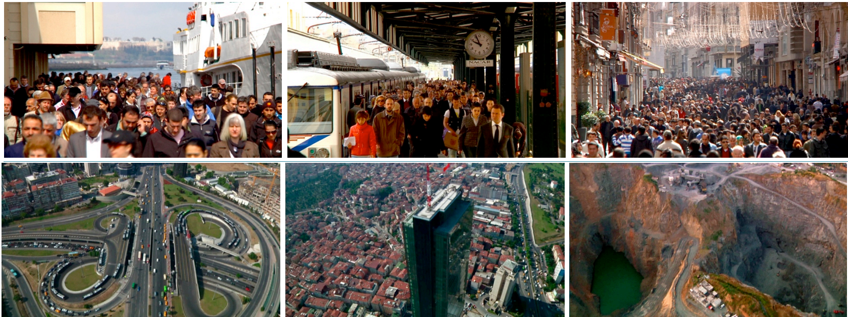
Video stills from the footage of VS Humanity – Istanbul, 2010

Through the Vital Space art platform we aim at raising public awareness on issues related to the environment and urbanisation by means of artistic interventions both outdoors and indoors. In a time of major confluence of economic and environmental crises, contemporary art, especially when it takes place in public spaces and is designed to reach and address a wider audience, can play a significant role in using the artist's perspective for dissolving the polarization which characterises the current dialogue on our relationship with nature and with one another. It can activate a deeper awareness about the most pressing issues of our time and help discern how art can be used to reach and influence a wider audience across the world.