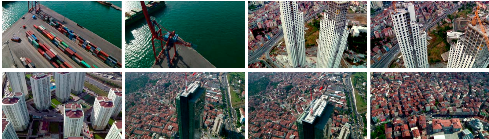
Video stills from the footage of VS Humanity – Istanbul, 2010

Vital Space – Istanbul is a video project comprising two films from the city of Istanbul. One film offers a bird eye's view of different paths connecting order and disorder, centre and suburb, privilege and dispossession, formal and informal.