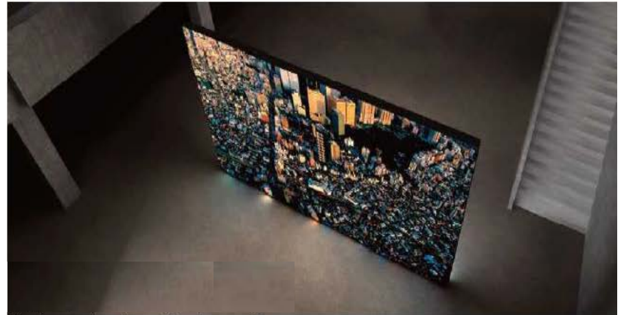
Vital Space Nature | Humanity, Installation Views, Renderings