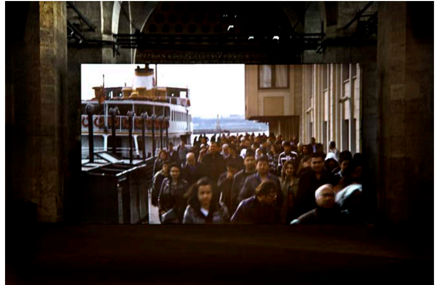
Video installation, V.S. Humanity. Tophane, Istanbul, 2010

On the one side of the wall the birds' eye view film was projected. On the other side, the ground level film was projected.